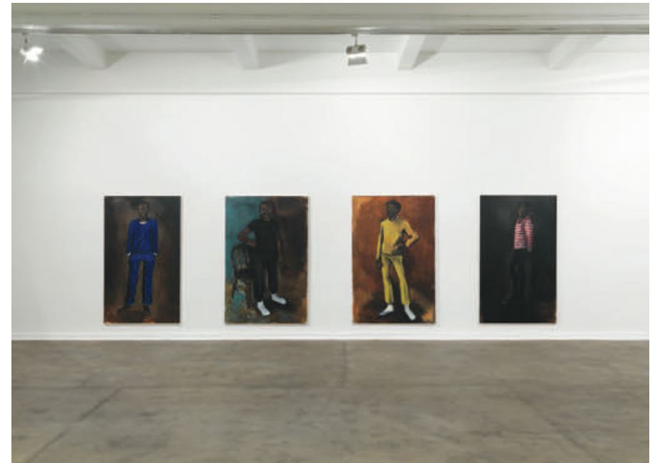
Above Installation view of Lynette Yiadom-Boakye’s exhibition, Extracts and Verses, 2012.