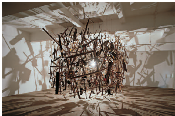
Right Installation view of Cornelia Parker's exhibition, Cold Dark Matter: An Exploded View , 1991. Courtesy of the artist and Frith Street Gallery. Photo: Hugo Glendinning.